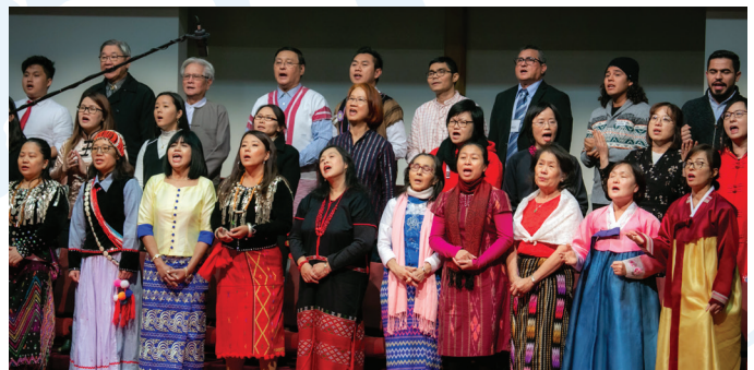
2019 New Life Festival