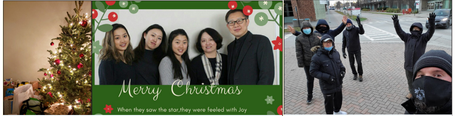
Merry Christmas & Happy New Year!