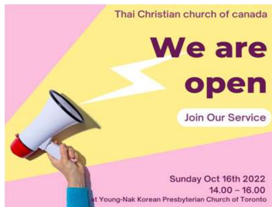
Thai Church Reopening Worship