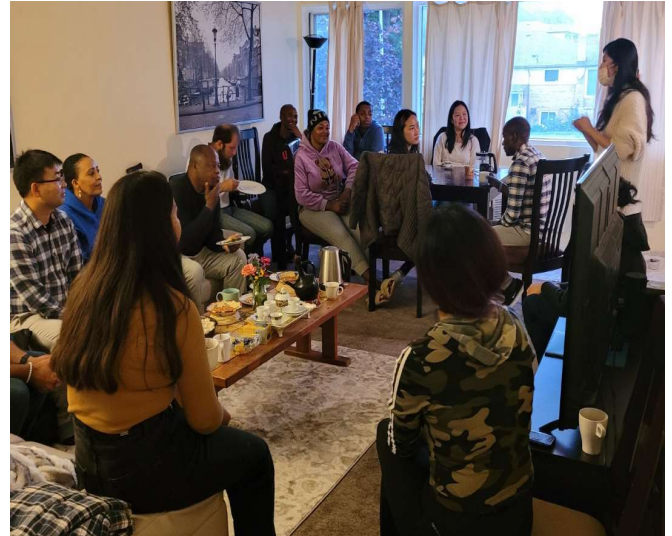
Friday Story Hour with Grace Toronto Team

To donate to Adam House's refugee ministry, visit the following link: http://raceroster.com/events/2022/34025/2022-tcs-toronto-waterfront-marathon/pledge/participant/16536888