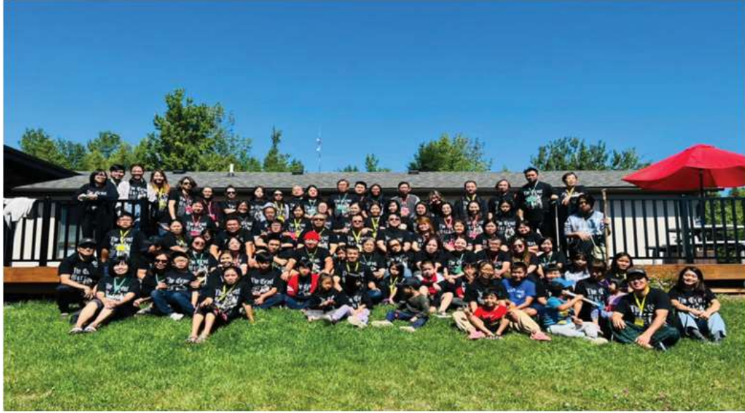
Toronto Myanmar Church hosted Summer Bible Camp in August 26-28 at Ontario Christian Camp with the topic, "The Great Warrior."