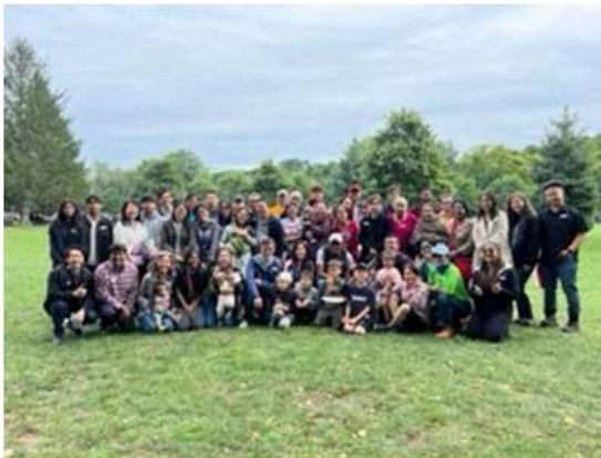
Thai Church Picnic on Labor Day at Morningside Park