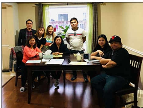
Arise Church Discipleship Training