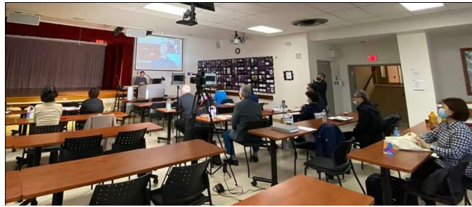
'Kingdom Life Basics Class

This second semester, in order to live out what we learned last semester, we have the 'Kingdom Life Basics' mission course, as well as the 'New Testament by Author'