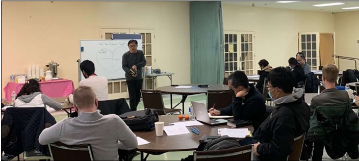
Gospel Conversations Training @ Willowdale Baptist Church

I participated in the Gospel conversation training held at the Willowdale Baptist Church on February 26th. The reason why I participated is that I wanted to know and learn what "Gospel conversation Training" is about. As soon as I entered the place, I was amazed to see lots of multicultural people sitting on the table for the training. Then I came to realize that regardless of culture and race, the Gospel is the same and powerful.