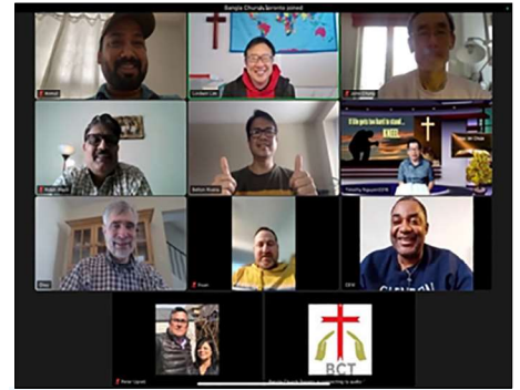
CMCA Family Koinonia(2022 Jan.)