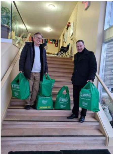
Delivery of Christmas Loving Package