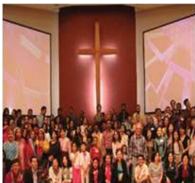
2015 Mosaic Cultural Festival

The Canada Mosaic Christian Alliance (CMCA) was born in the Greater Toronto Area of Canada, renowned as a multi-ethnic city, to create new resources to share the unchanging Gospel in a changing world as a diaspora mission agency. The CMCA, which God is establishing to serve the unreached peoples who do not yet have their own ethnic churches, commits to challenge, support, and engage all the believers to live a missional life that embraces the world, in partnership with local churches in four areas of mobilizing prayers, missional education/training, planting ethnic churches through immigrant ministry, international student ministry, and refugee ministry, and networking to renew the Kingdom Multiplication movement in every city by training and cultivation of making disciples of all the nations. We want to play a part in the call to world evangelization by planting churches among the unreached peoples of the diaspora and creating a communal reverse mission movement through the diaspora that evangelizes their home countries. We invite all of you to do this.