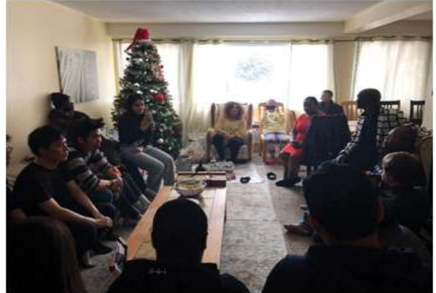
Adam House North Story Hour