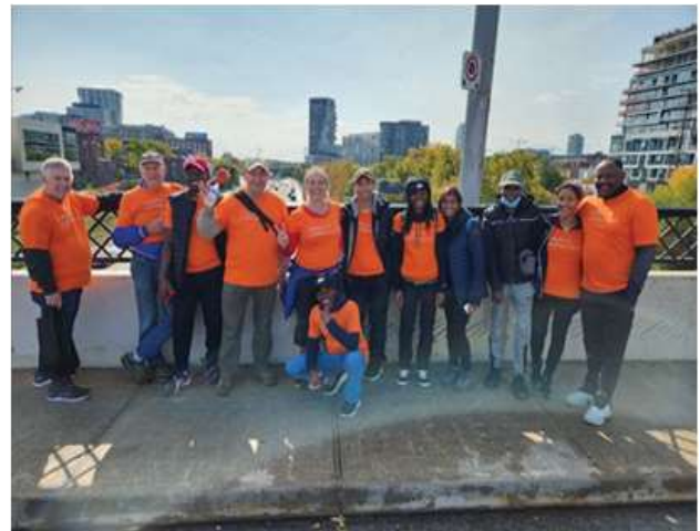
Charity Challenge 2022