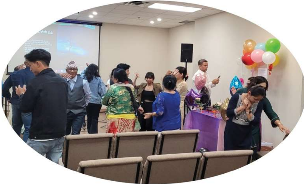
TNCF 8th Anniversary Gathering