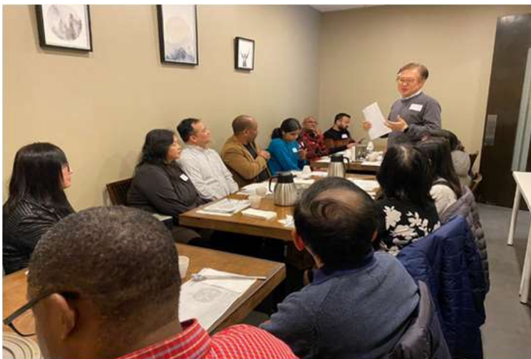
Pastors/Leaders Christmas Luncheon Meeting 2022