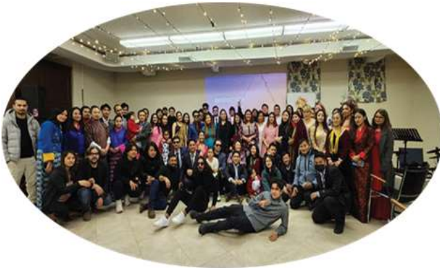
HNCC Christmas Gathering