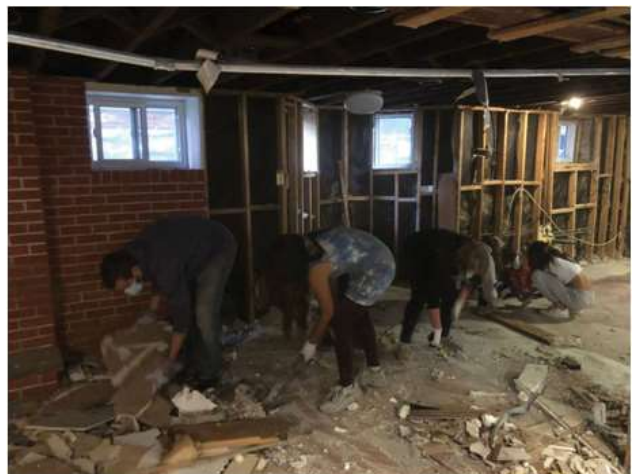
Adam House Renovation