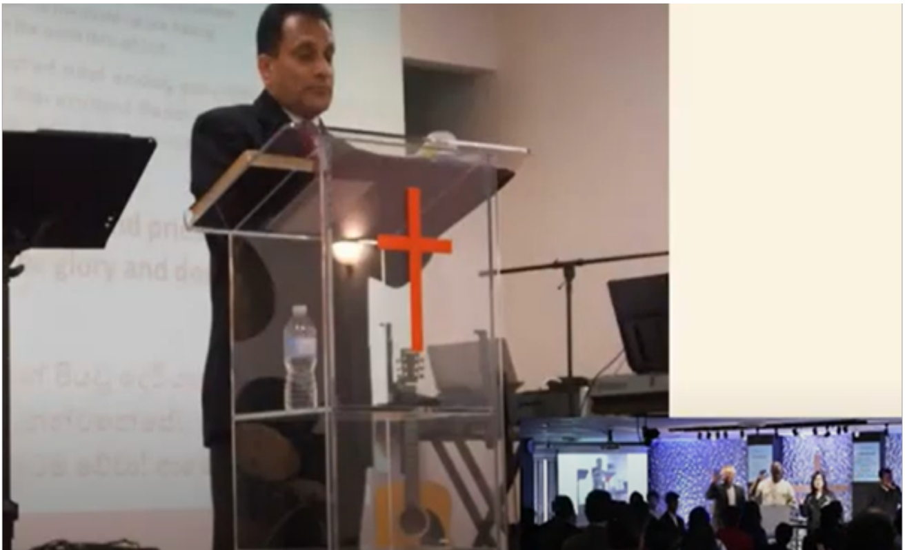
10th Anniversary Worship, NEW FELLOWSHIP CHURCH